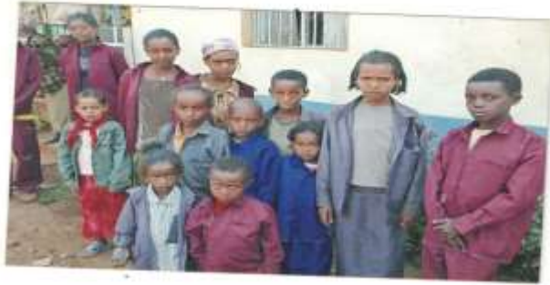
Poor and AIDS-orphaned children being supported with school uniforms by WALDA