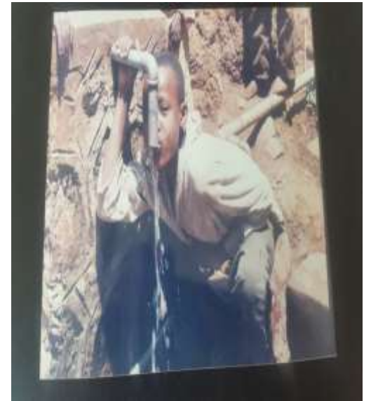
Children joyfully and comfortably washing clothe on slabs (left) and fetching clean water (middle) and drinking the safe water (right)