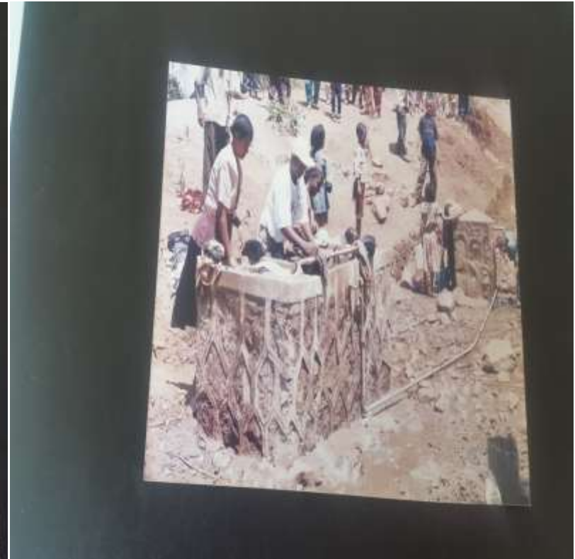
Both men and women wash their clothe comfortably which would have been done by women only