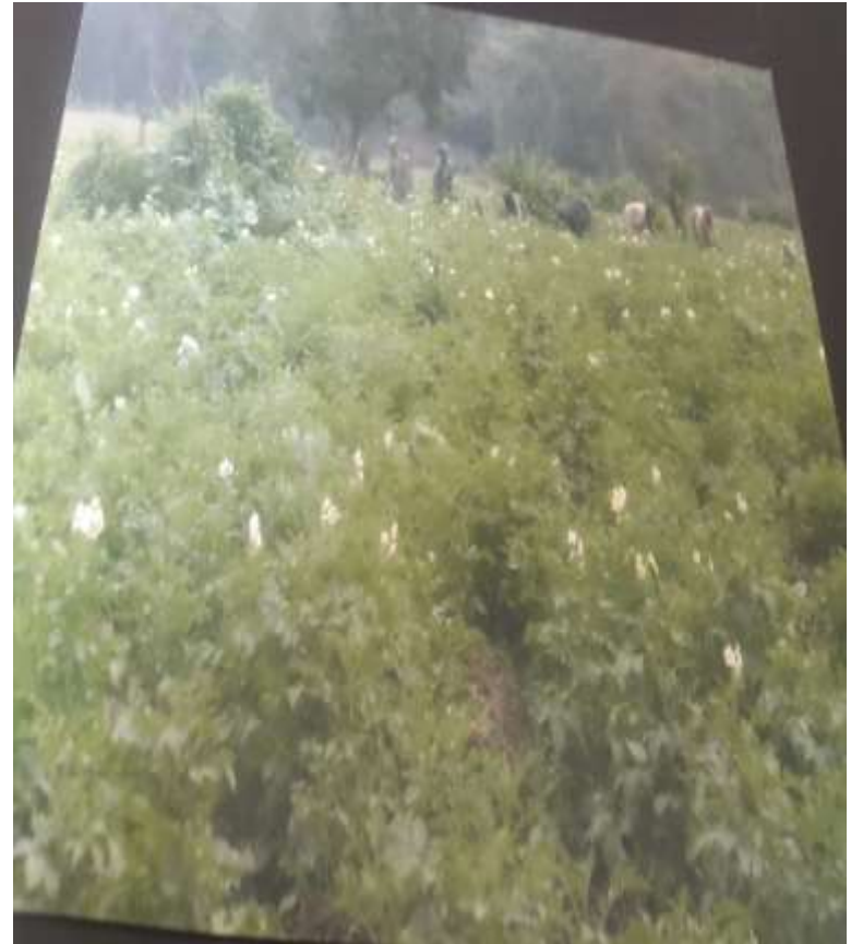
A pile of Teff grown and harvested by one women group (left) and a potato plantations grown and owned by another women group (right) in Anfilo Woreda by irrigation.