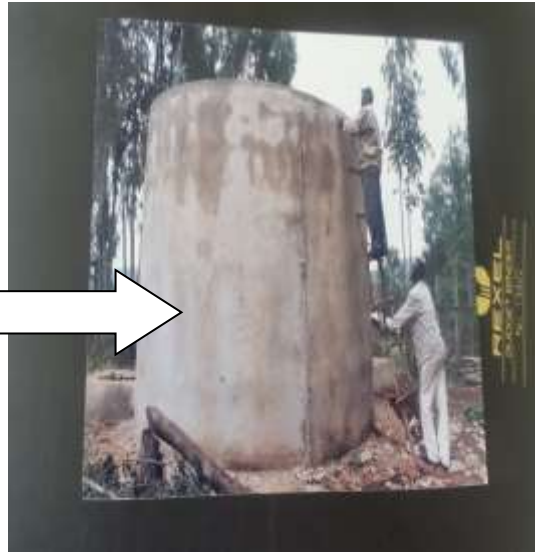
One of the standard water points constructed by WALDA on gravity scheme