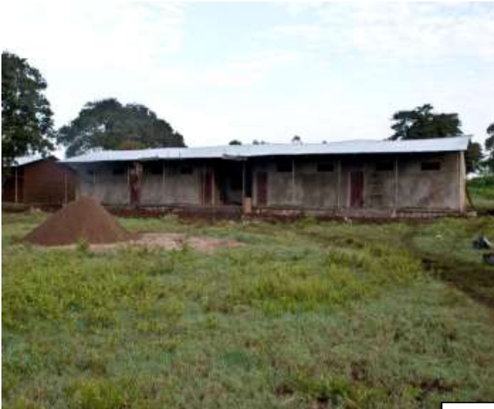
(Above, left) One of the 4 room additional class rooms constructed for rural school by WALDA (Mechara elementary school, Hawa Galan Woreda)