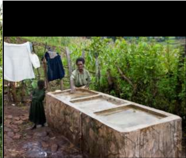
One of a well fenced spring on spot water points(left), Hand dug well fitted with hand pump(middle) and a washing slab (right) all constructed by WALDA