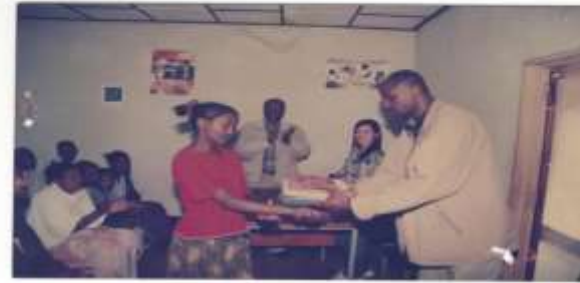
Poor and orphaned students being provided with school materials WALDA