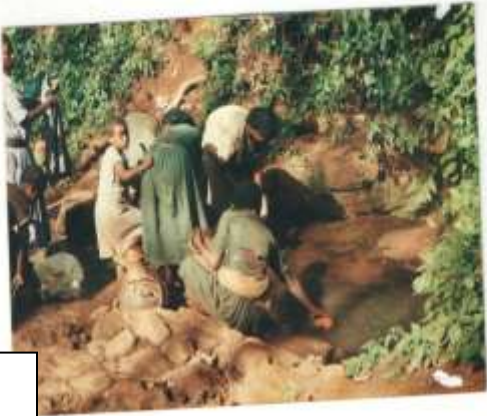
hing nce of