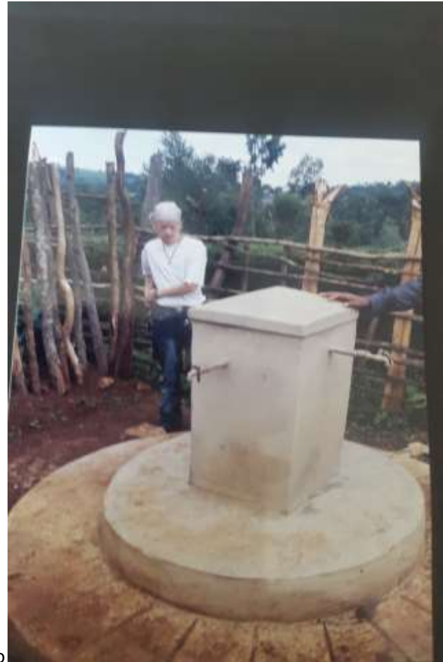
Women income generation project (sheep rearing) being monitored by WALDA's head office staff and a water scheme by donor representative