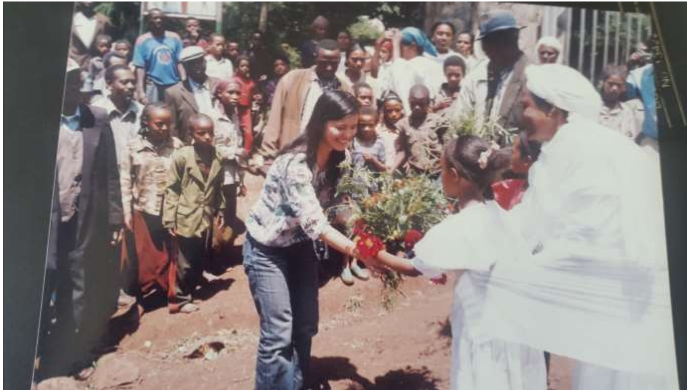
Community receives WALDA donors with bunch of flowers