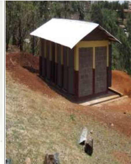
Two of the modern pit latrines with many rooms constructed for urban schools by WALDA (Olika Dingle Junior Secondary school (middle) and D/D 03 school (right))